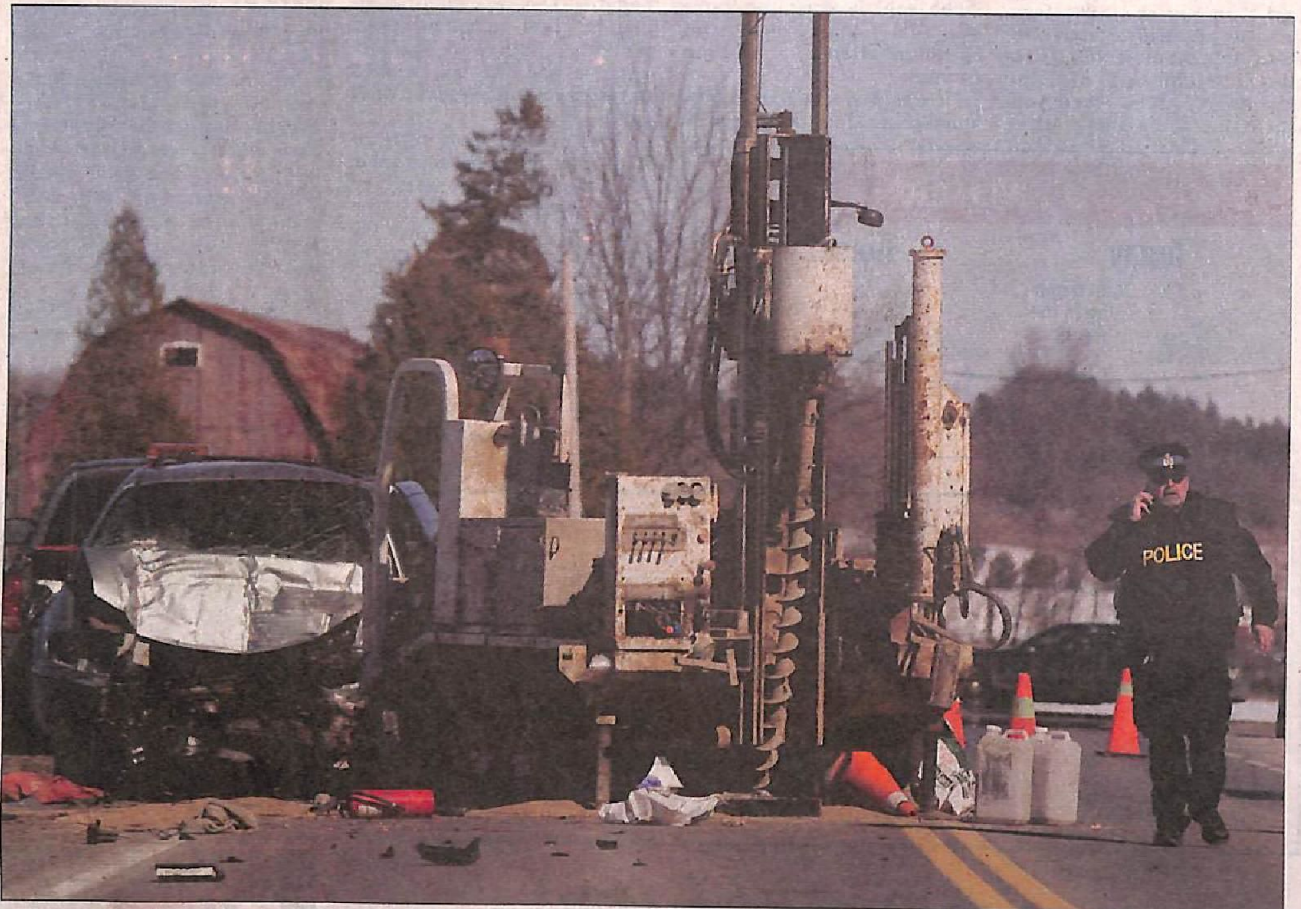
Northumberland OPP officers were on scene of a fatal motor vehicle collision which resulted in the closure of County Road 2, east of Grafton on Friday.

The road was clear at the time and police say a post mortem may help determine if a medical