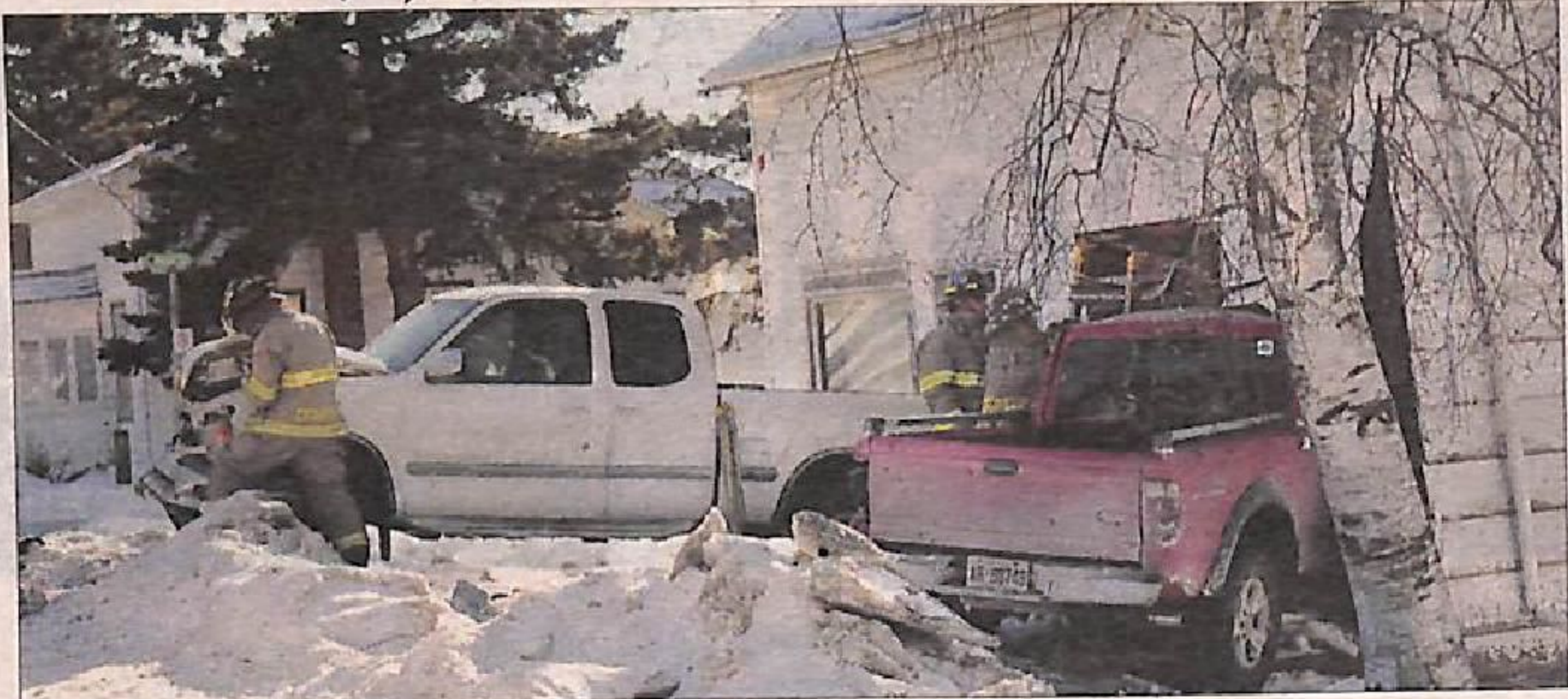
COLBORNE -- Two pickup trucks ran into a house on Percy Street in the early afternoon on Jan. 3. The homeowners escaped unharmed and the vehicle occupants were transported to hospital.

Percy Street was closed in both directions to traffic while Northumberland OPP investigated and while the trucks were removed.