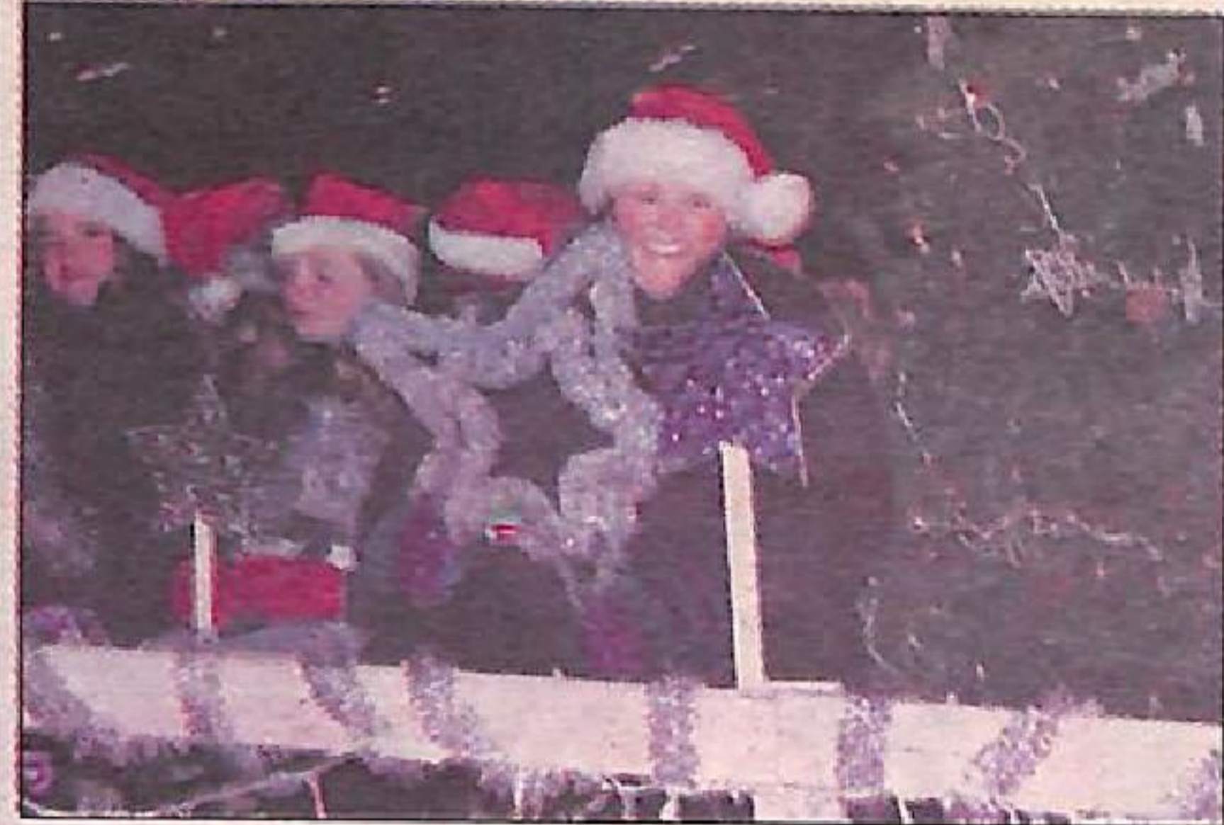
Northumberland Hills Public School had one of the many local floats that made their way down Colborne's main street in advance of the village's special guest – St. Nick himself.