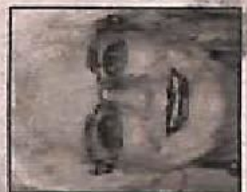
Pat Westrope CRAMAHE COUNCIL CORNER