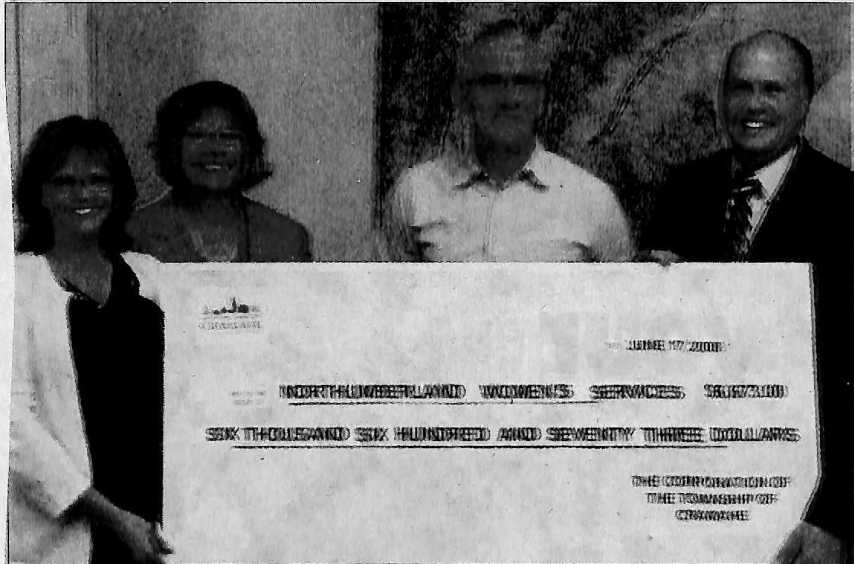
COLBORNE CHRONICLE JUNE 26/08