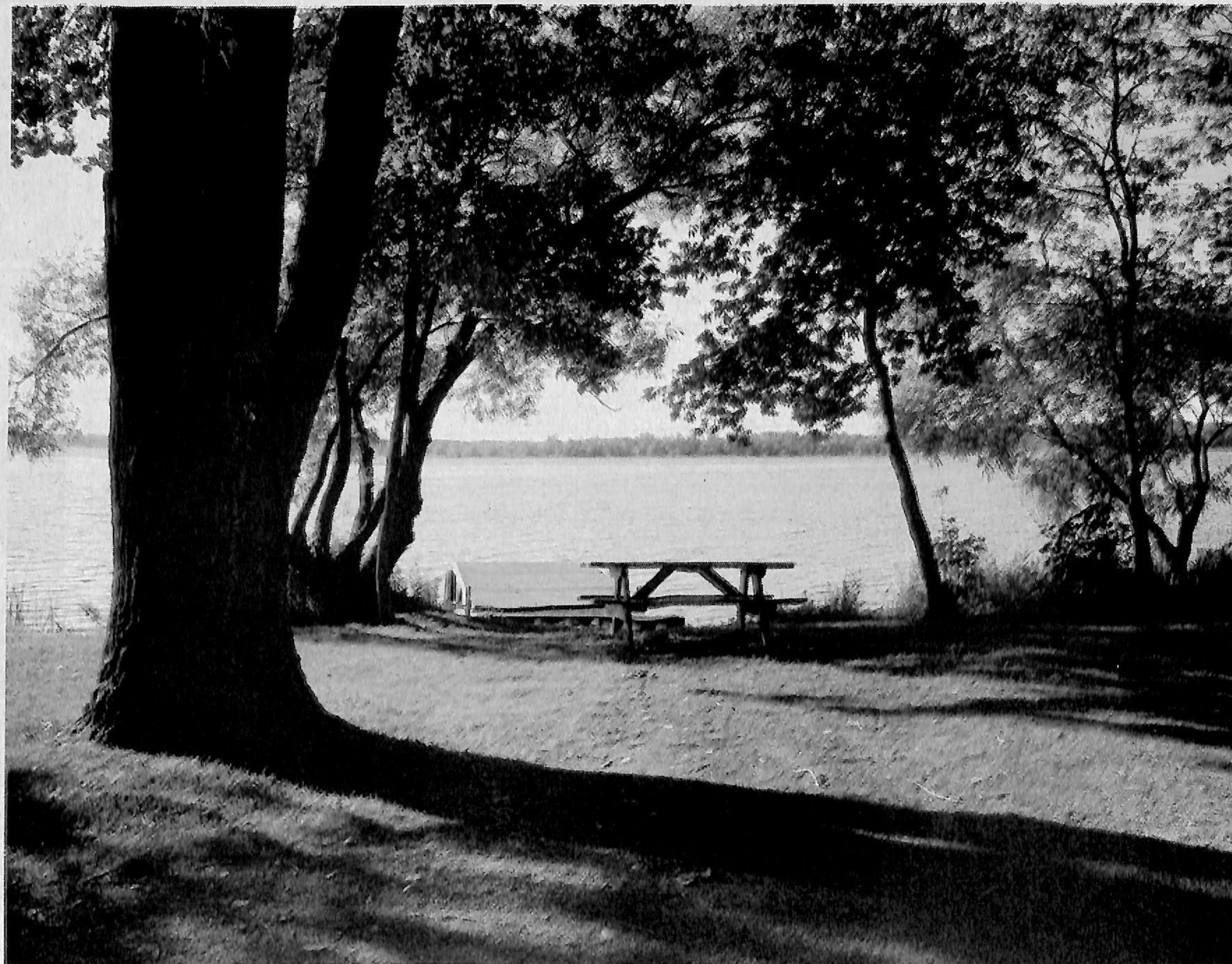
Enjoy a serene stop at the Harbour Street Parkette on Lake Ontario at Brighton.

Soon after the school, you'll pass some cottages that ring Little Lake on your left, though the best view you'll get of the lake