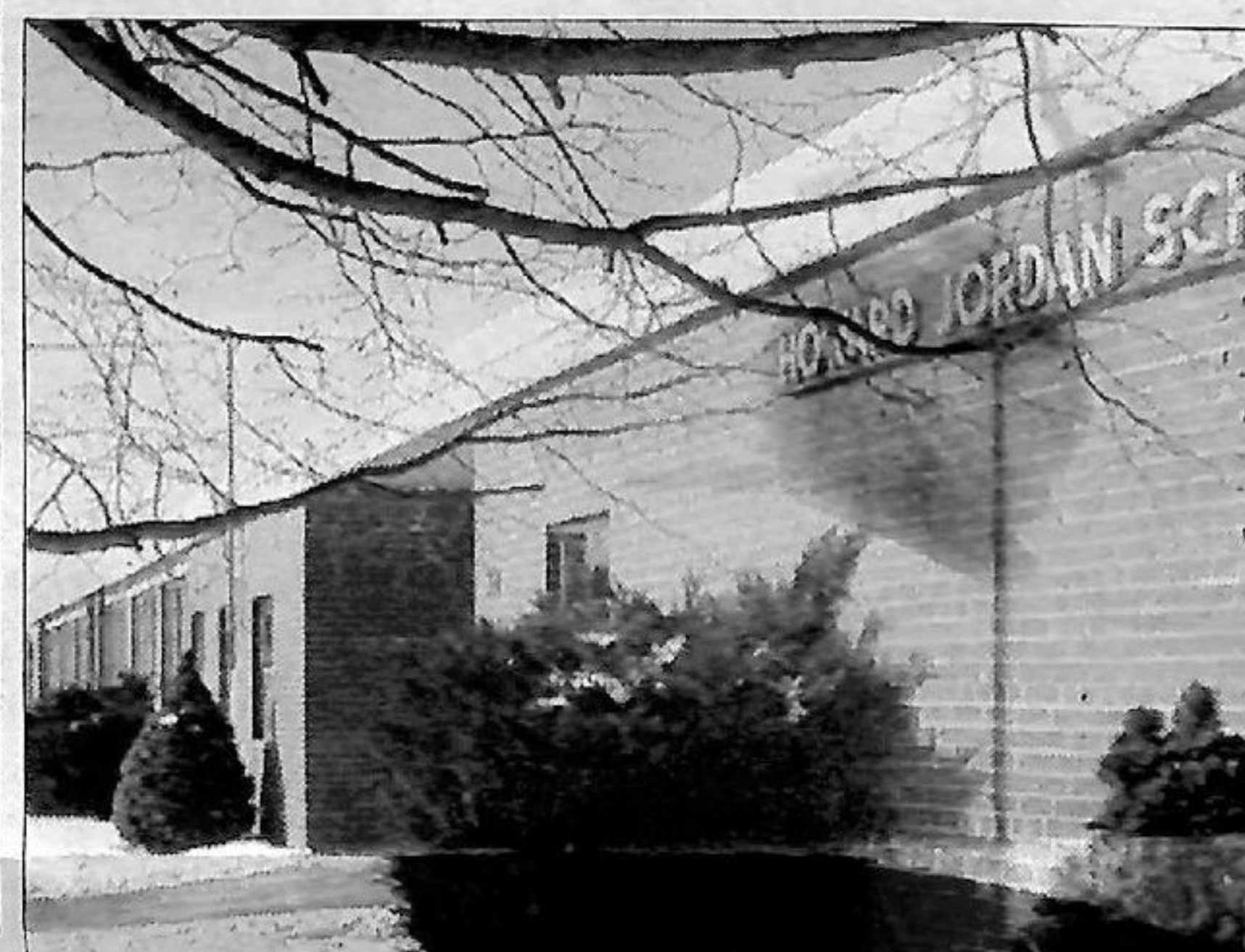
Howard Jordan Public School

Expected closing date: The end of this school year