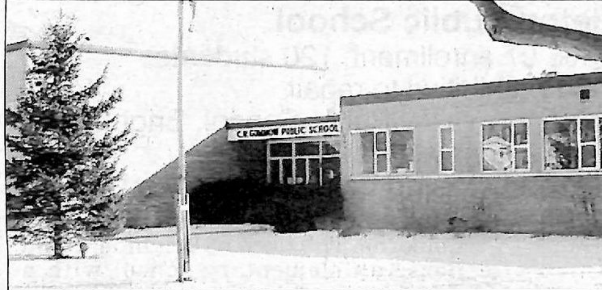
C.R. Gummow Public School, Cobourg

Main campus built in 1953 2006/07 enrollment: 680 students Closure?