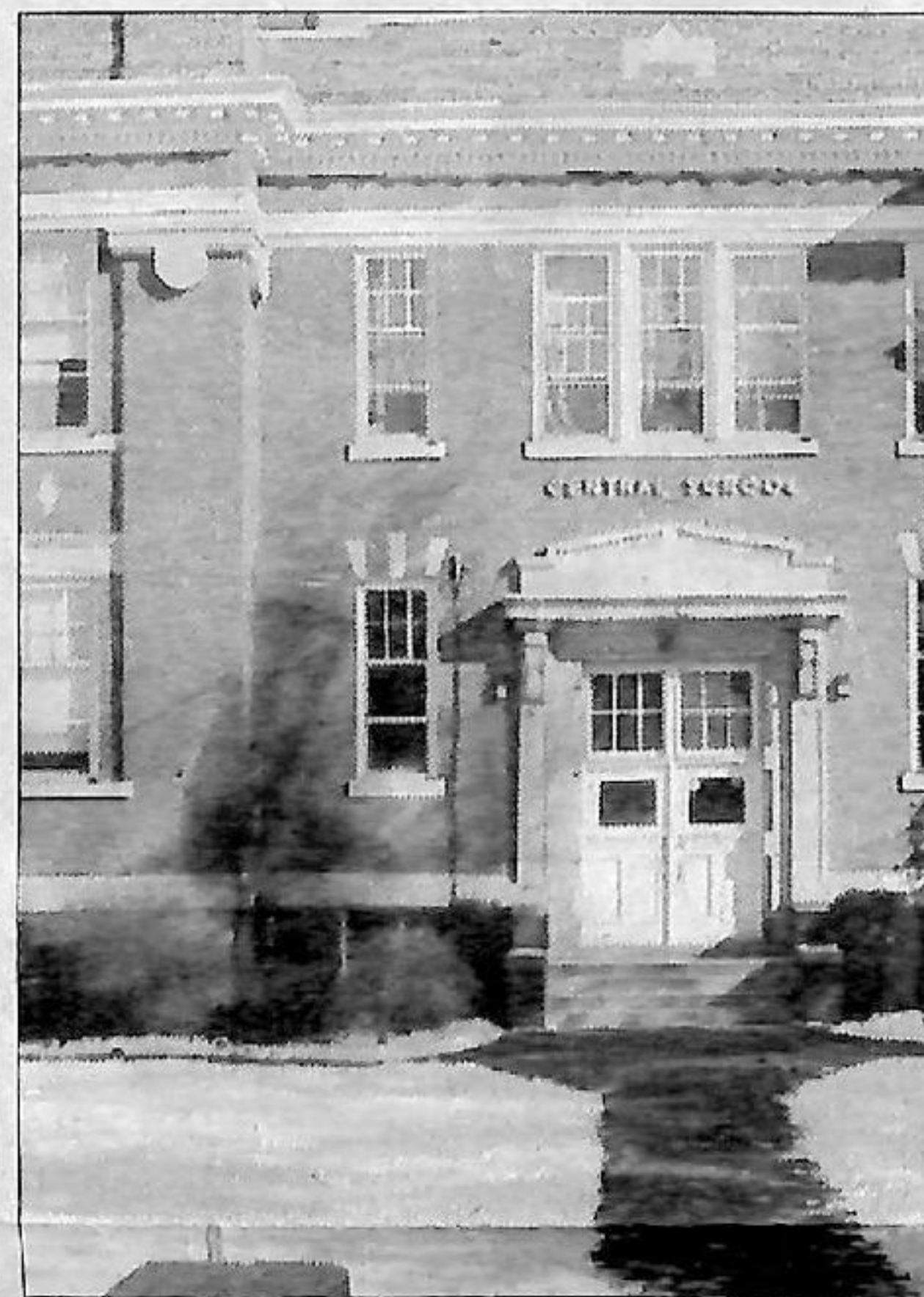
Central Public School

A new school was approved for the Howard Jordan Public School site pending funding following the School Review Process of Central Public School. Its targeted opening date is 2008.