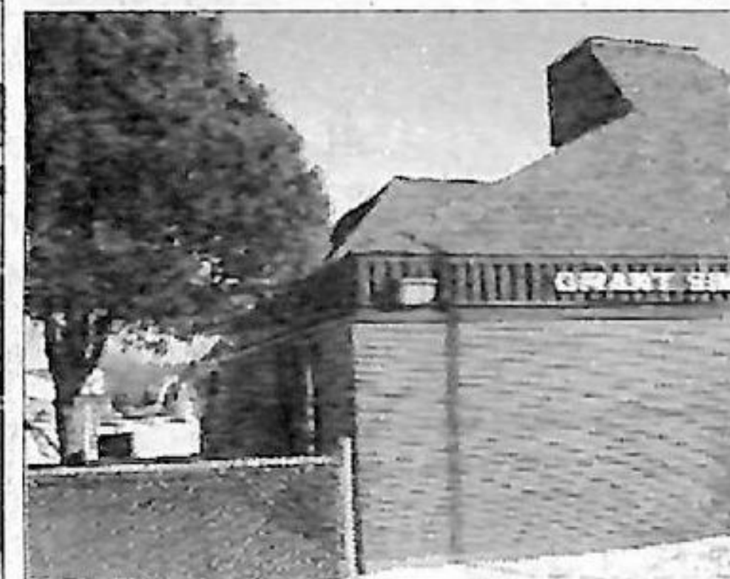
Grant Sine Public School, Cobourg

Main campus built in 1953 2006/07 enrollment: 680 students Closure?