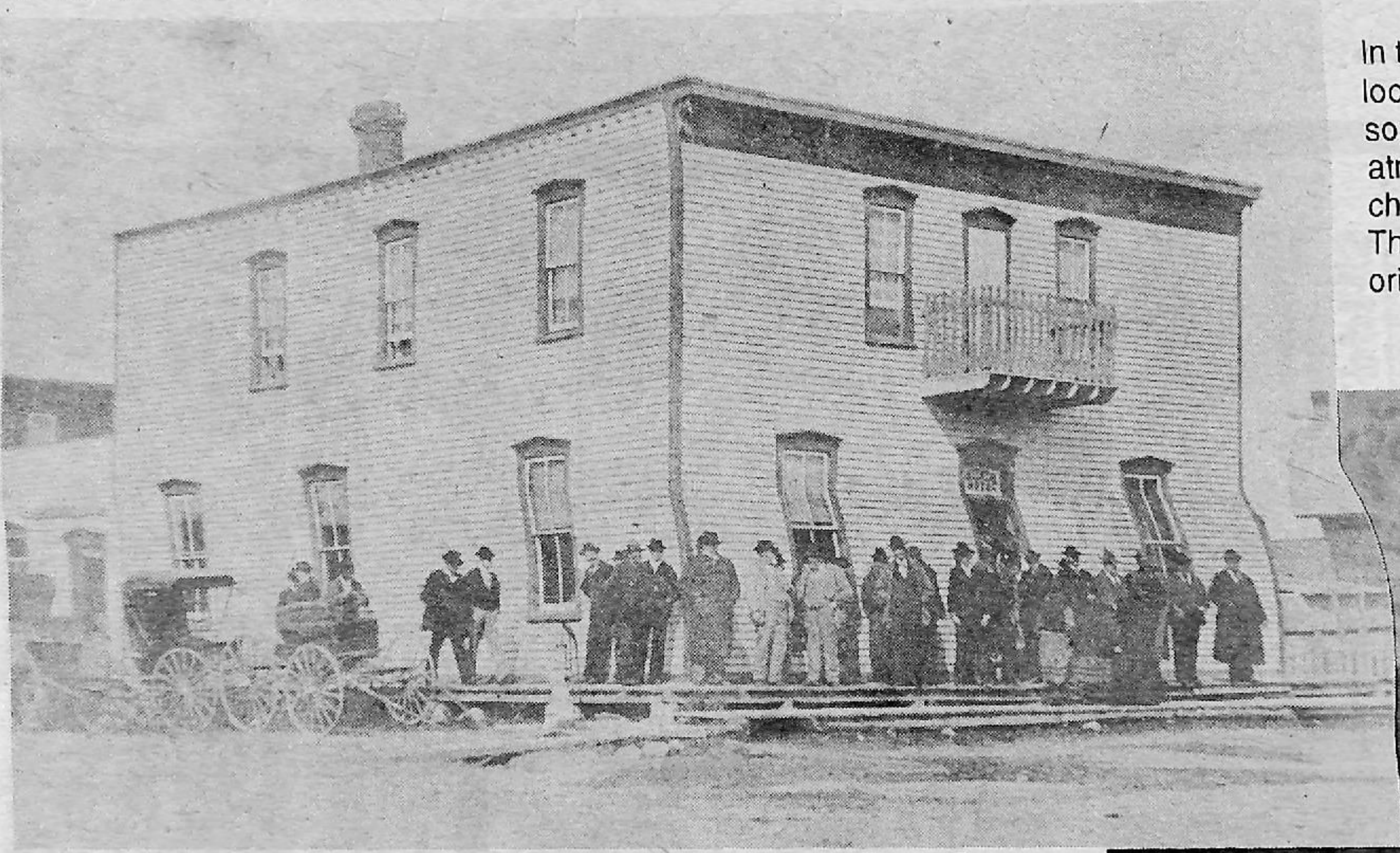
In the late 1800s, the Oriental Hotel (left) was a local hot spot. The building has undergone some modification but retains much of the old atmosphere. The hallway (bottom left) has changed little since it greeted weary travelers. The kitchen stove (below) is one of many original features.