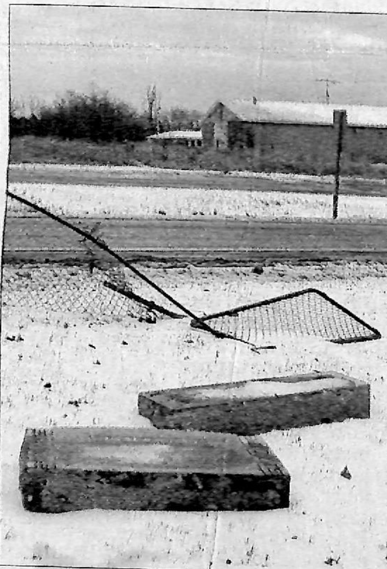
An accident late January 2 or early in the morning January 3 has left the Union Cemetery board with a costly problem. A head stone lies in the snow and the fence along County Road 25 is damaged.