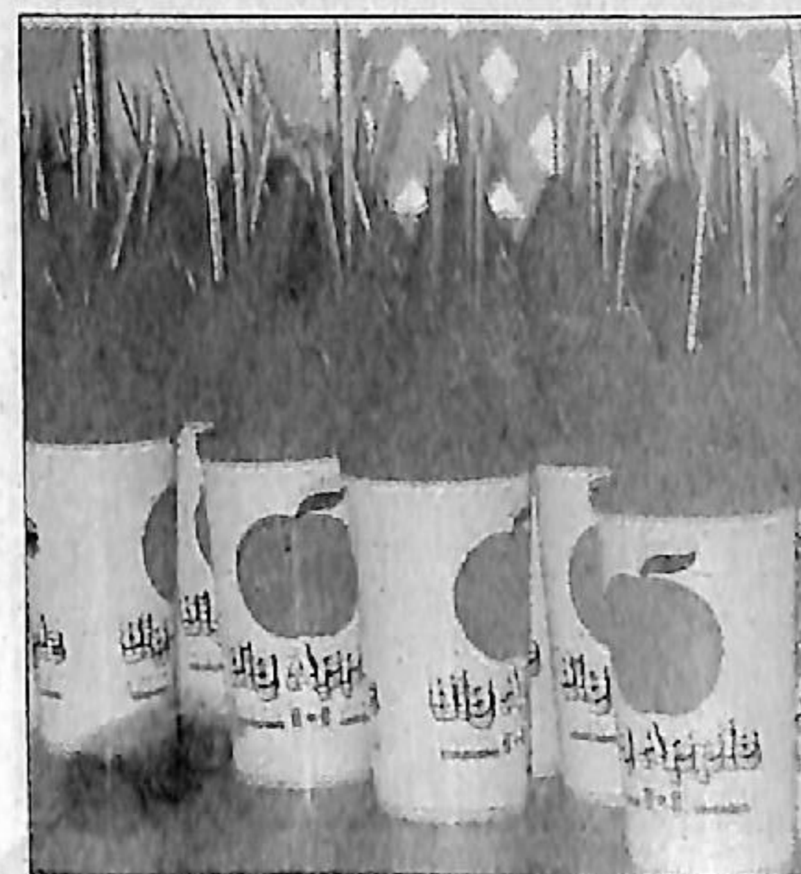
Like rows of tiny redcoats, Sippy Cups ready to be filled.