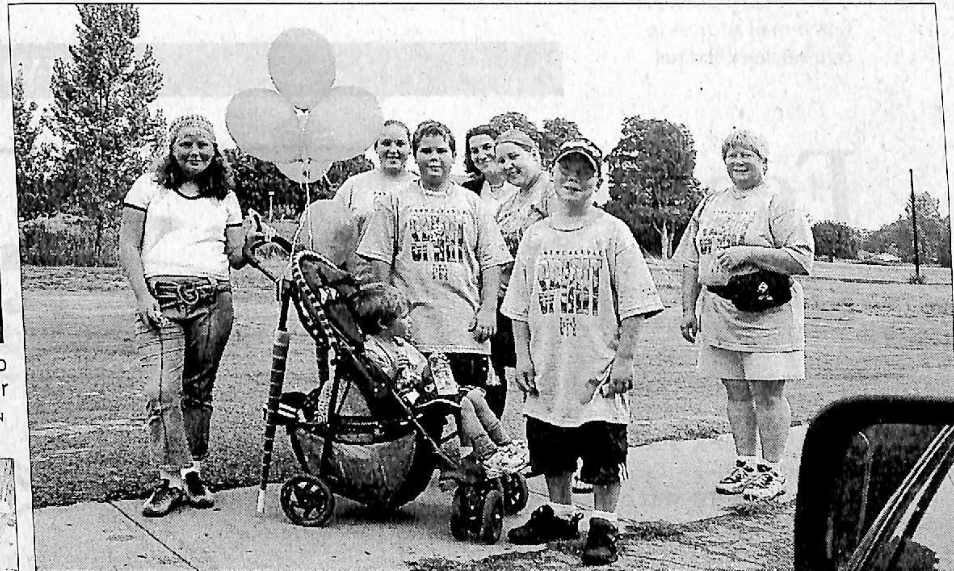
Hail, hail the gang's all here. A crowd of walkers make the big turn for the walk back to Victoria Square.