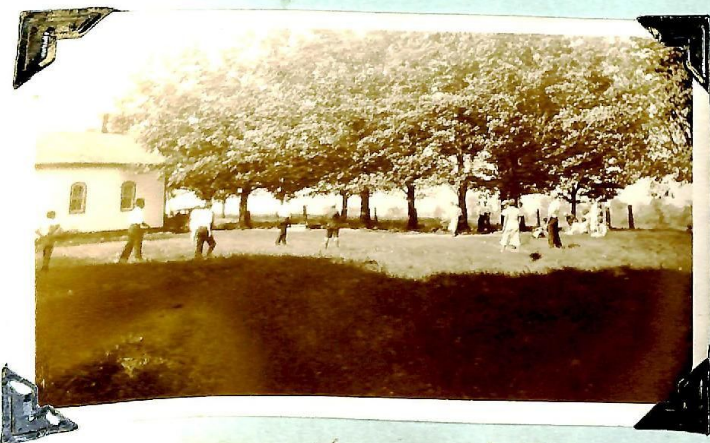
Cadmus School visits Mahoods baseball game between the two schools.