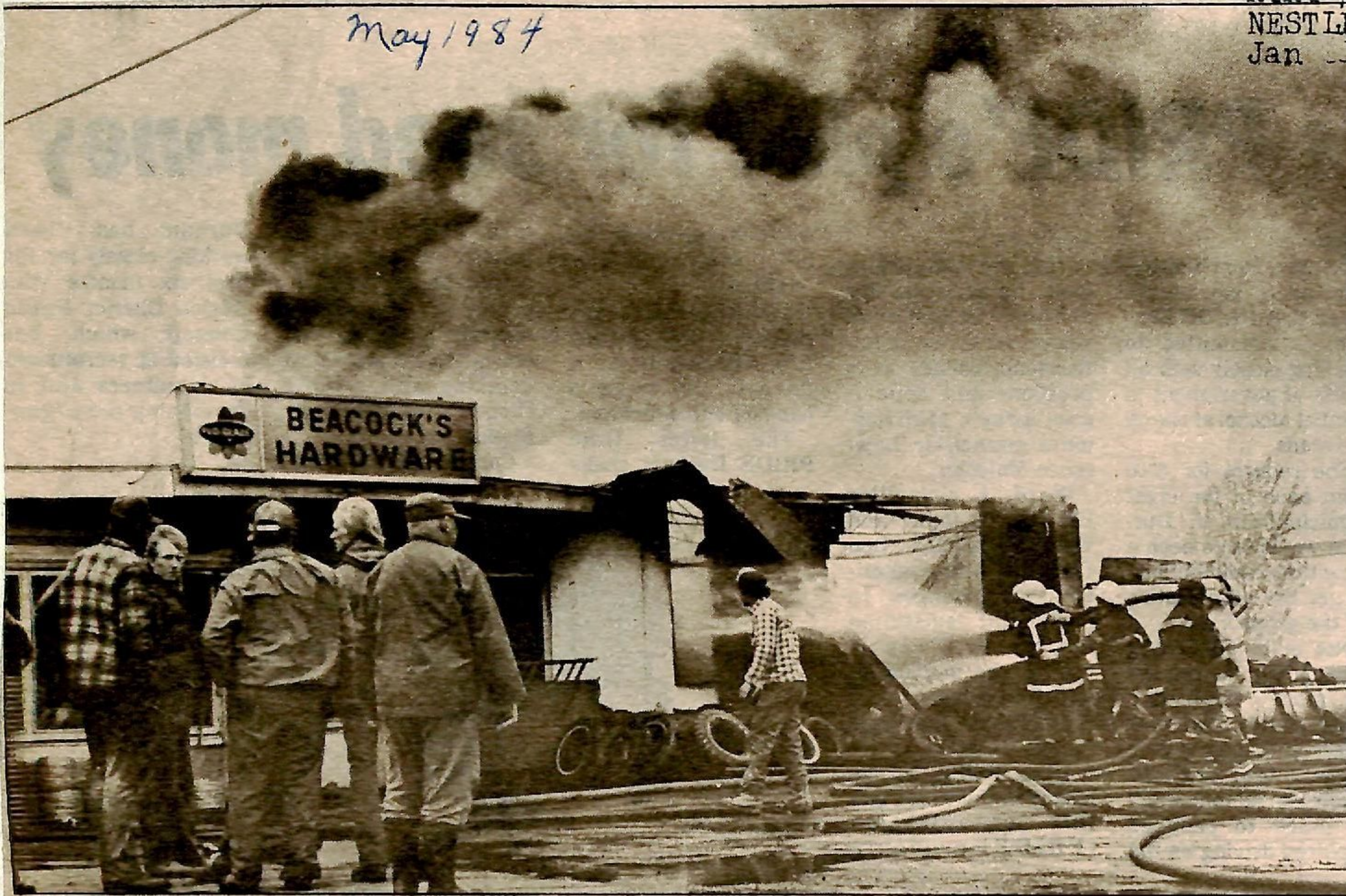
It seemed like the whole town of Blackstock was there to watch as Beacock's Hardware, somewhat of an institution in the community, burned to the ground last Wednesday afternoon. Some $150,000 worth of damage was sustained when fuel exploded inside the building. Luckily, nobody was seriously injured. See story for details.

In 1982 the north wall was cement blocked.