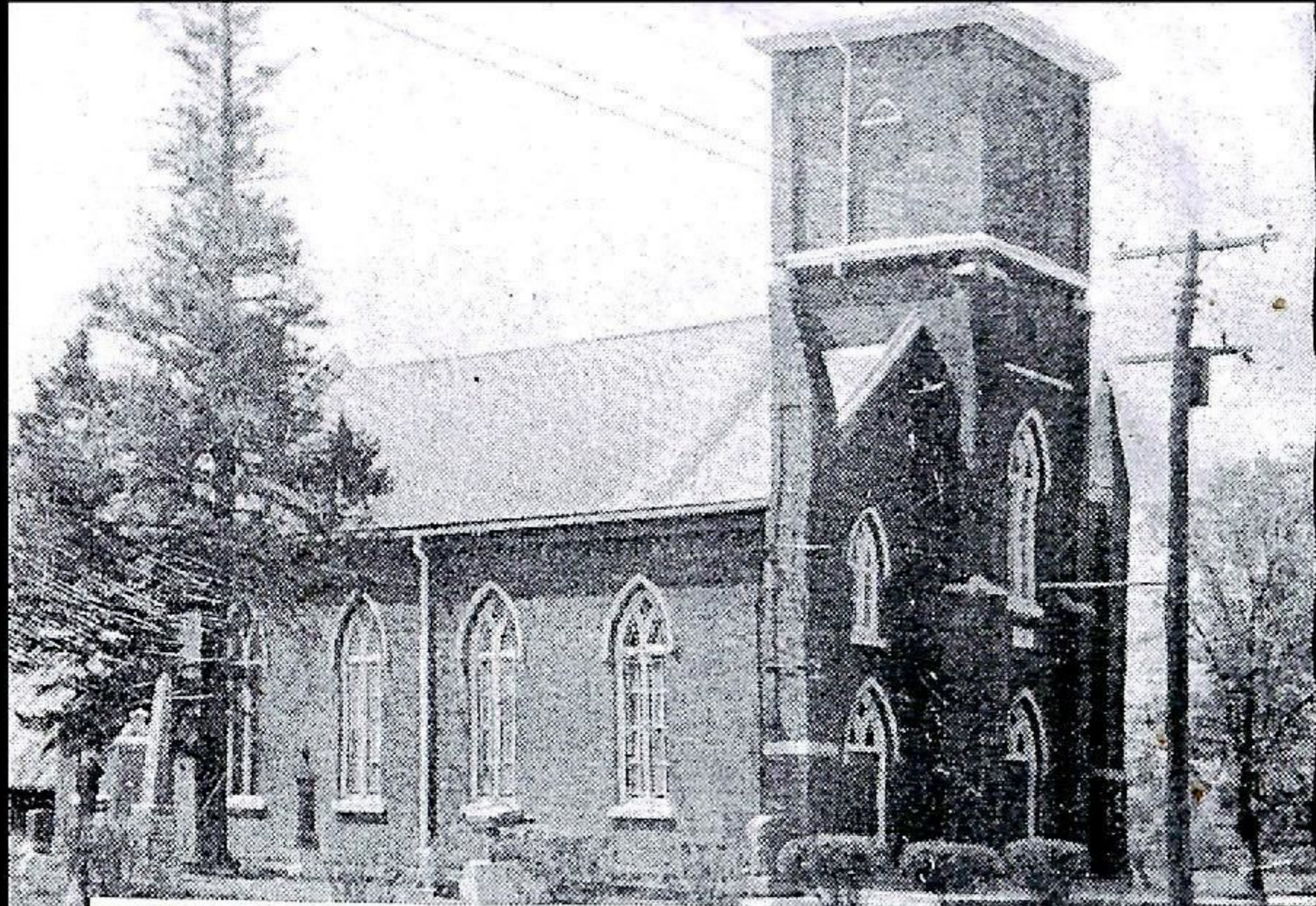
CENTREVILLE PRESBYTERIAN CHURCH Built in 1863

First services were held in a log school-house on the site 1825 – 1832