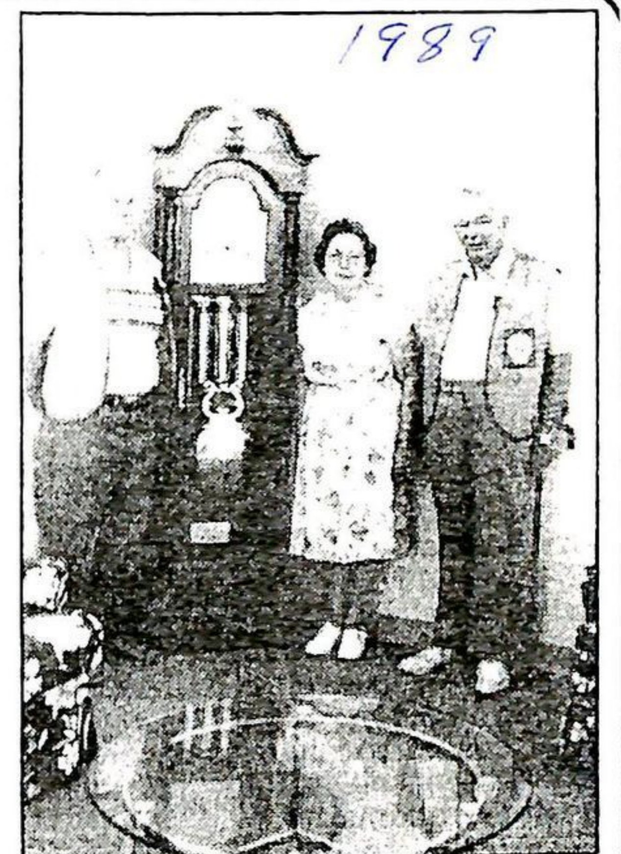
Smith of Highland Tours.