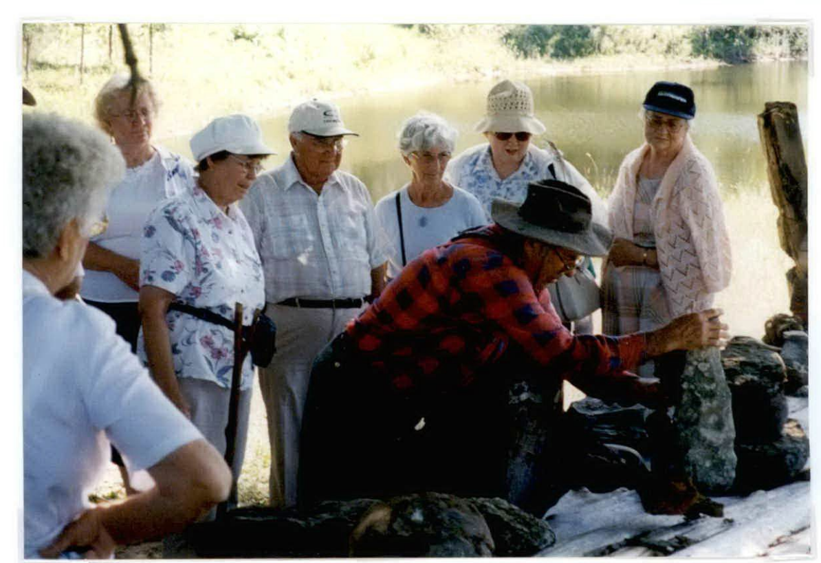
TOURING BLUEBIRD ACRES

JULY 19 - 8:00AM - Meet in Wellington opposite the "Churches".