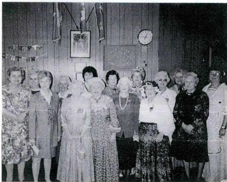
The Wellington, Consecon and Hillier branches of the Women's Institute gathered at the Hillier Township Hall last Wednesday, February 19, 1997 to celebrate the 100th Anniversary of the Women's Institute. The