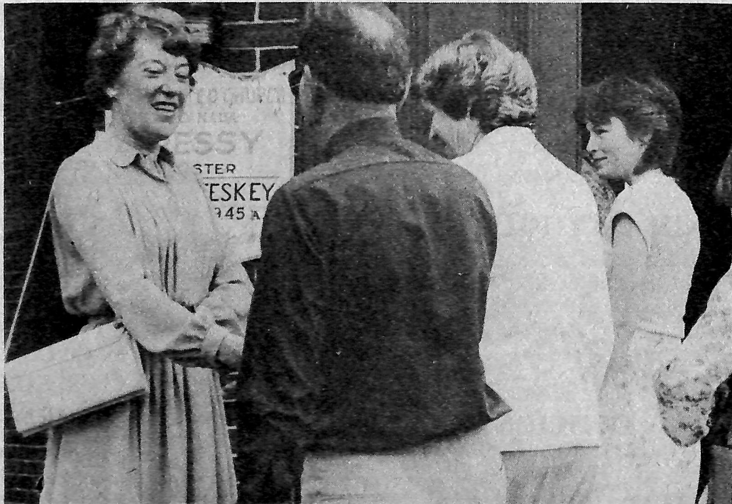
Flora MacDonald is shown outside Cressy United Church greeting members of the congregation.