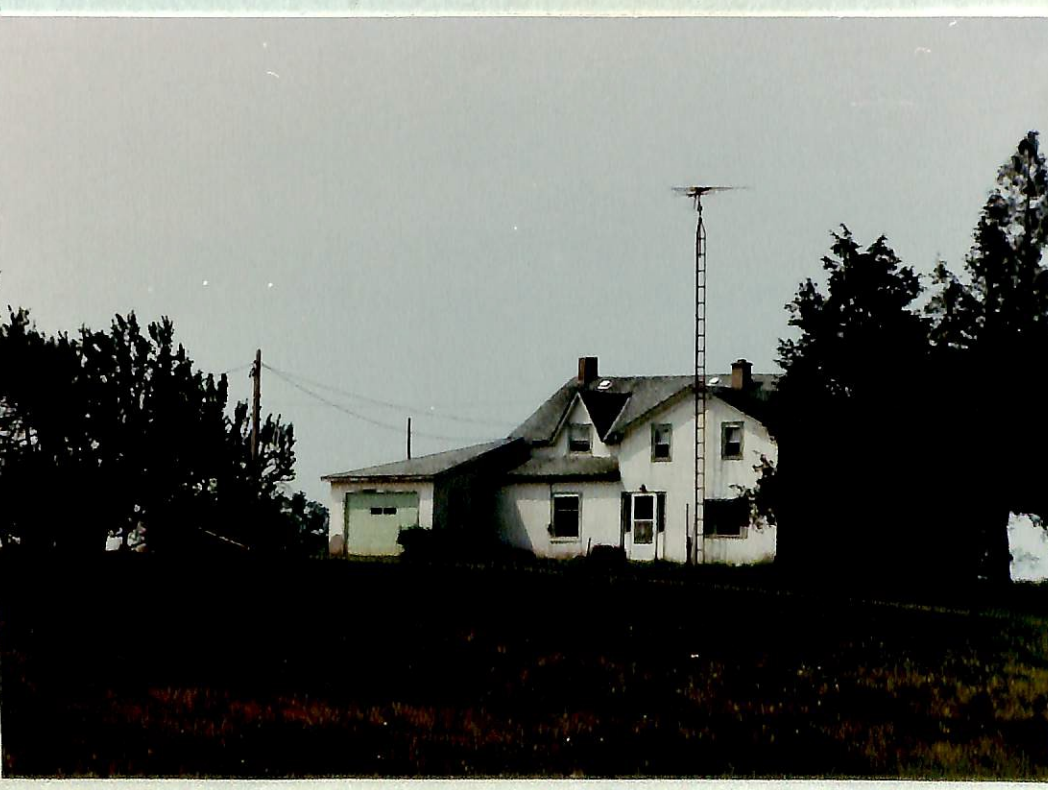
TAKEN = JUNE, 1984