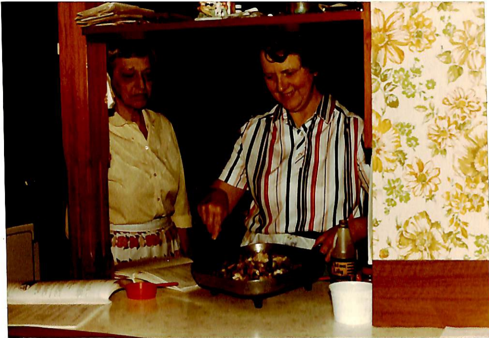
MORE CENTS THAN DOLLARS- 1983-1984.