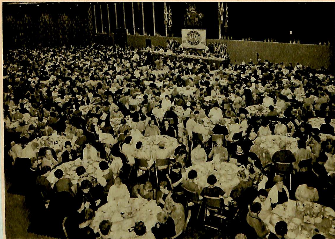
The crowd, over sixteen hundred women attending the 75th Anniversary Celebration.