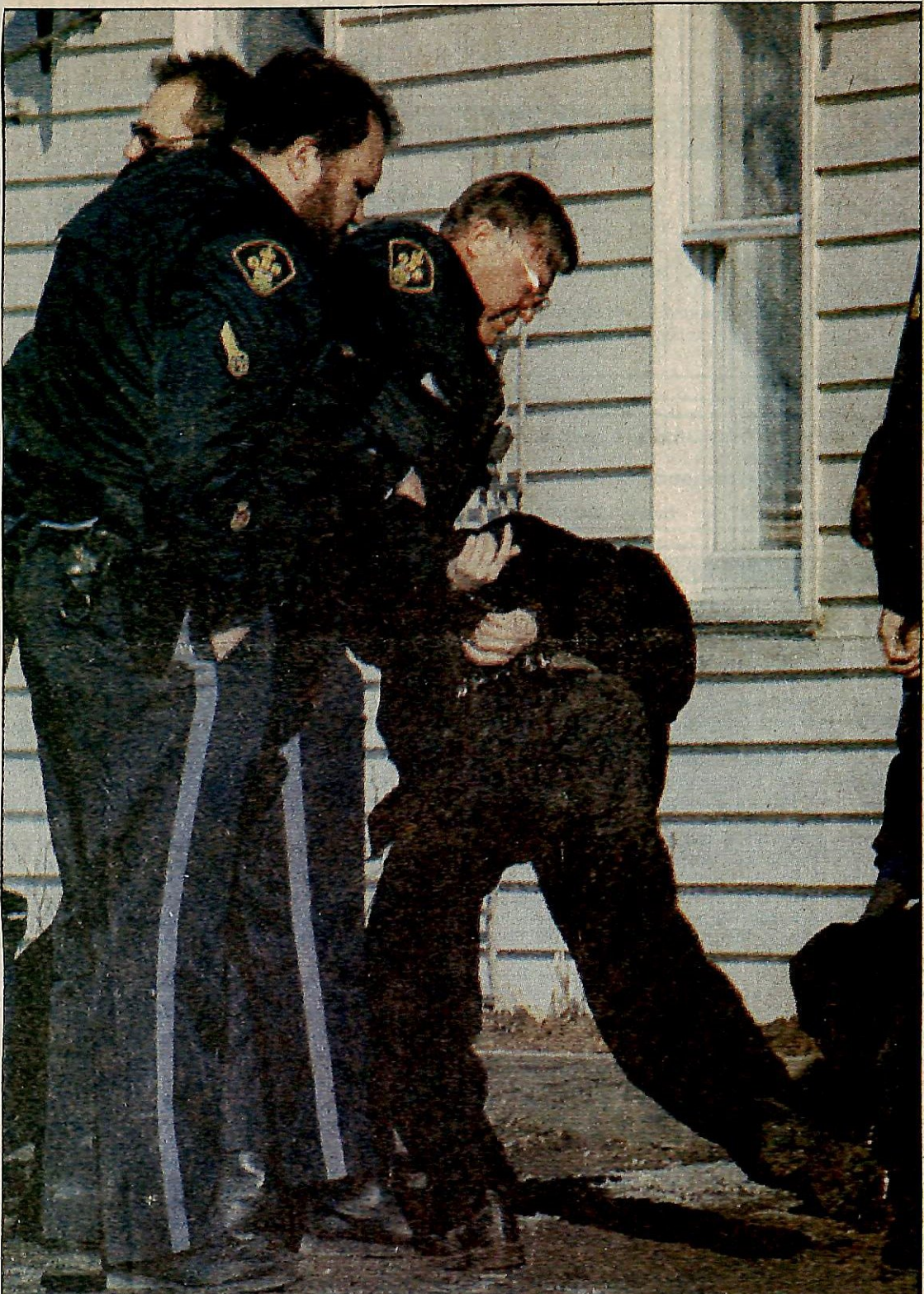
MONDAY MARCH 13, 1995

Police had not released information on identities of the suspects or charges at press time today.