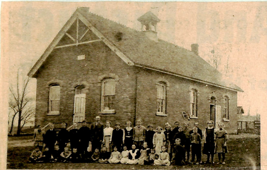
BAYSIDE SCHOOL 1910