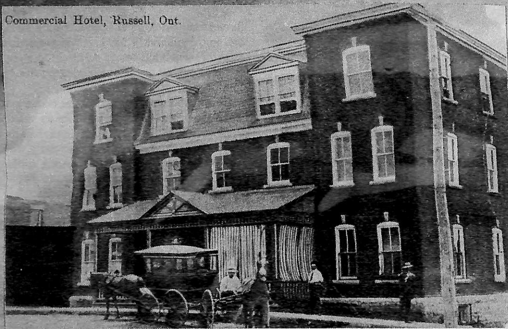
Commercial Hotel, Russell, Ont.