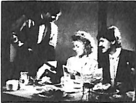
Elegant dining facilities