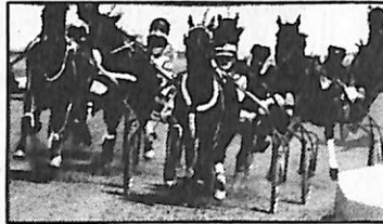
Superb half-mile track racing

The finest half-mile harness racing complex in all of North America, flamboro downs has played host to over 7 million people since our opening in 1975. We invite you to experience our World Class facilities, hospitality and thrilling harness racing entertainment - year round.