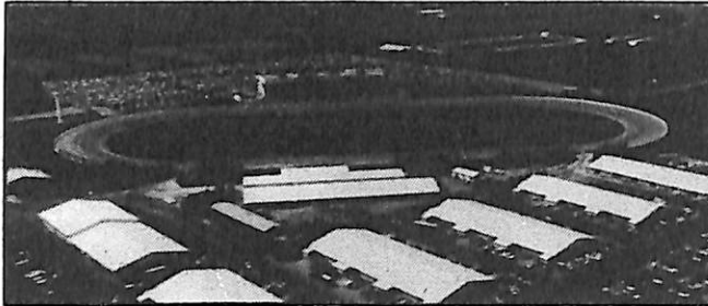
4,000 seat enclosed air conditioned grandstand