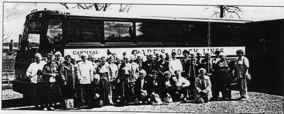
The Scots party enjoying the Canadian sunshine.