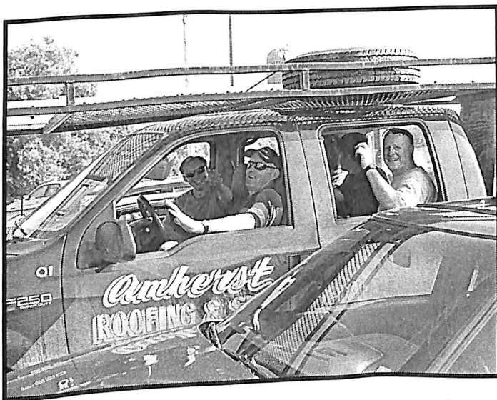
AN AMHERST ROOFING CREW HEADS HOME TO THE ISLAND ON BOARD THE FRONTENAC II AFTER A LONG, HARD DAY TAR ROOFING SCHOOLS.