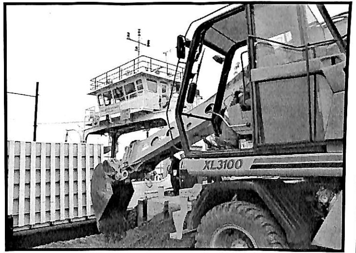
Above: A Loyalist Township heavy machine operator digs out the gravel base, lowering the ramp area for the much smaller Quinte Loyalist.