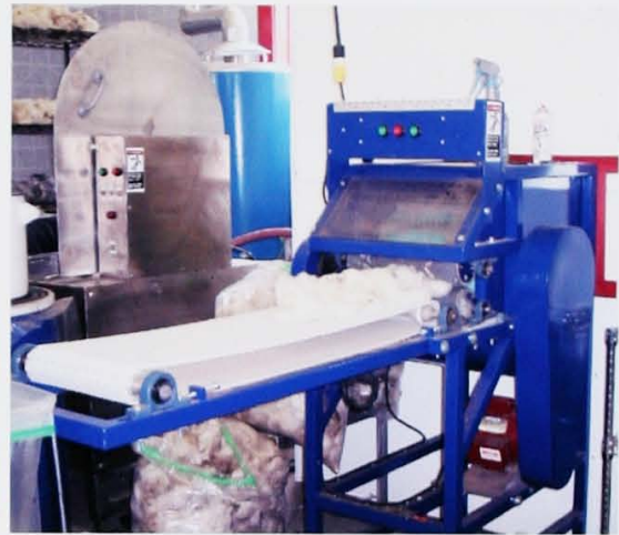
Draw frame - stretches the fibre more.