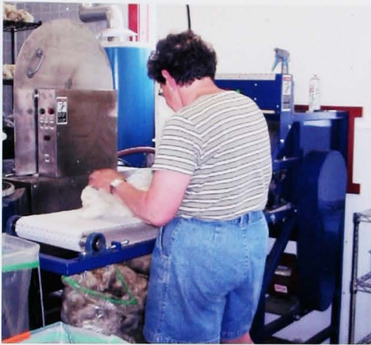
The carder - stretches and combs the fibre.