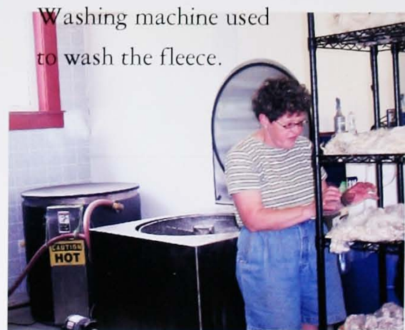
Washing machine used to wash the fleece.