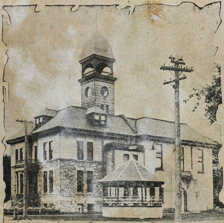
EARLY PICTURE OF WALKERTON TOWN HALL