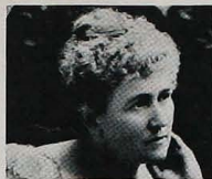
Mrs. Adelaide Hoodless, Co-Founder