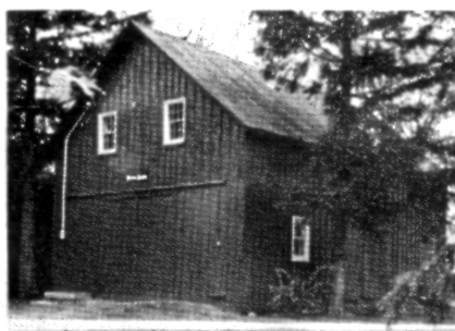
Displays of farm related implements and tools. Quilts and other interesting artifacts can be seen here.