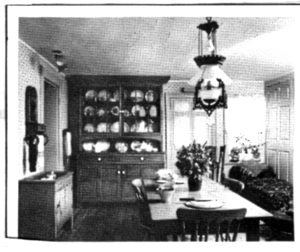
view of pioneer kitchen, including al hand-hewn pine cupboard.