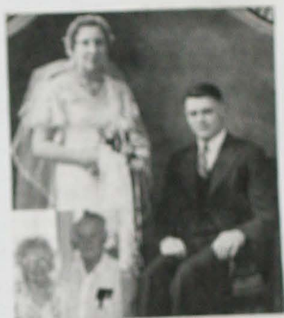
50th WEDDING ANNIVERSARY