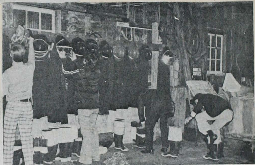
Gotta be careful not to get dirty! 1976 October

A total of 19 volunteers will man the Saugeen Township Fire Department, which has already been called out on seven fire incidents.