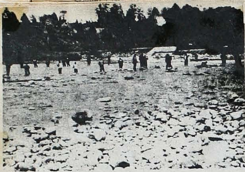
Hundreds of fishermen test their skills during the fall run of rainbow trout immediately downstream of Denny's Dam.