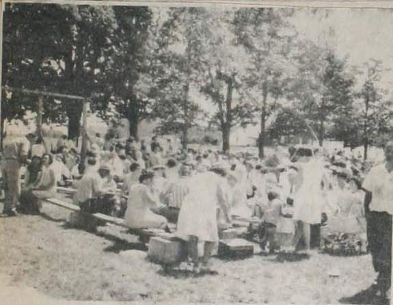
REGISTRATION at the school reunion held on Sunday at S.S. No. 4, Saugeen, numbered 485. Former pupils came from as far away as British Columbia and California for the reunion. Part of the large crowd is seen enjoying the picnic lunch.