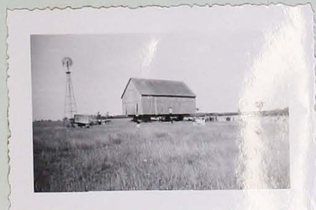
3. Easing to level ground.