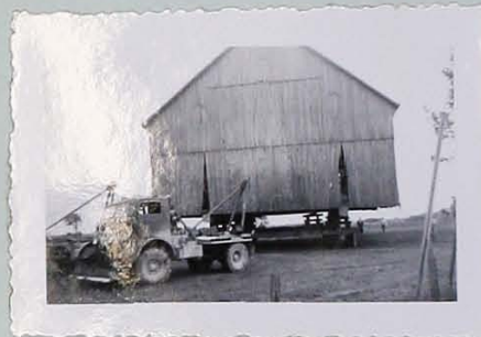
5. Approaching the barnyard.