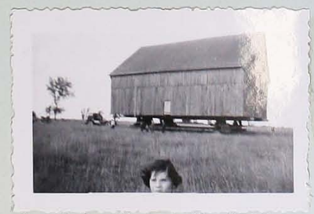
4. Moving through the field to Lot 19.