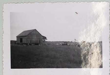
2. Preparing to move the barn off the wall.