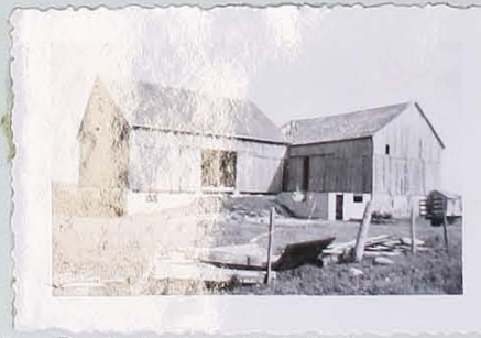
8. Ready to be completed.