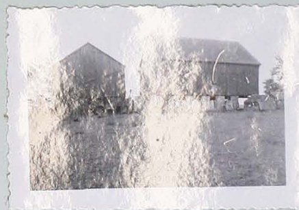
7. Winching the barn onto the wall.