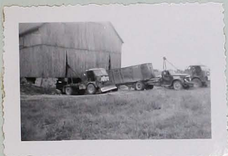
1. Loading the barn.