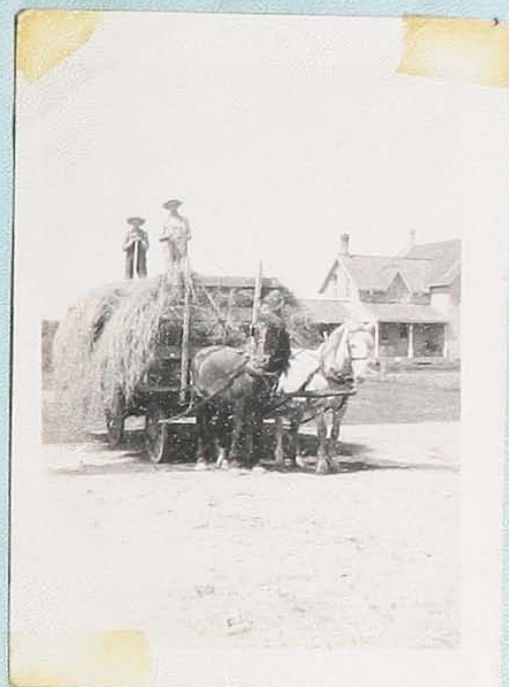
Load of Loose Hay