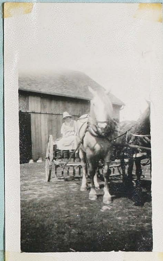
Old Seed Drill.