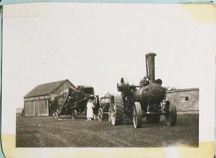
Old Thresher and Steam engine.