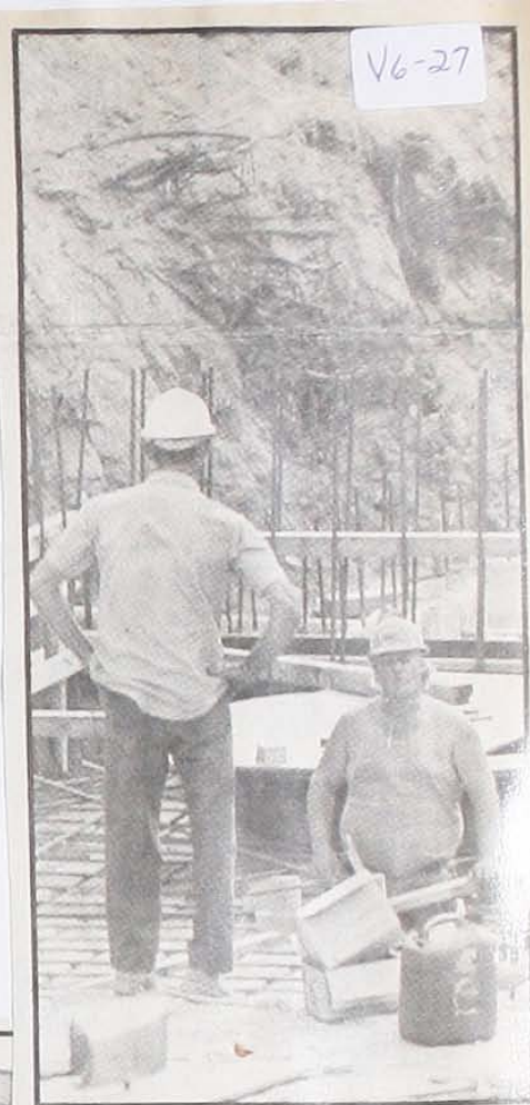
DRY WEATHER CONDITIONS have moved the Maple Hill Power Station project along nicely on schedule. Work started in early July and should wrap up by November.