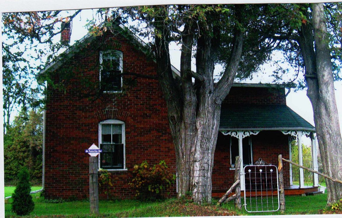
Usher family home in the late 1800's , now a summer home for Deevy Family