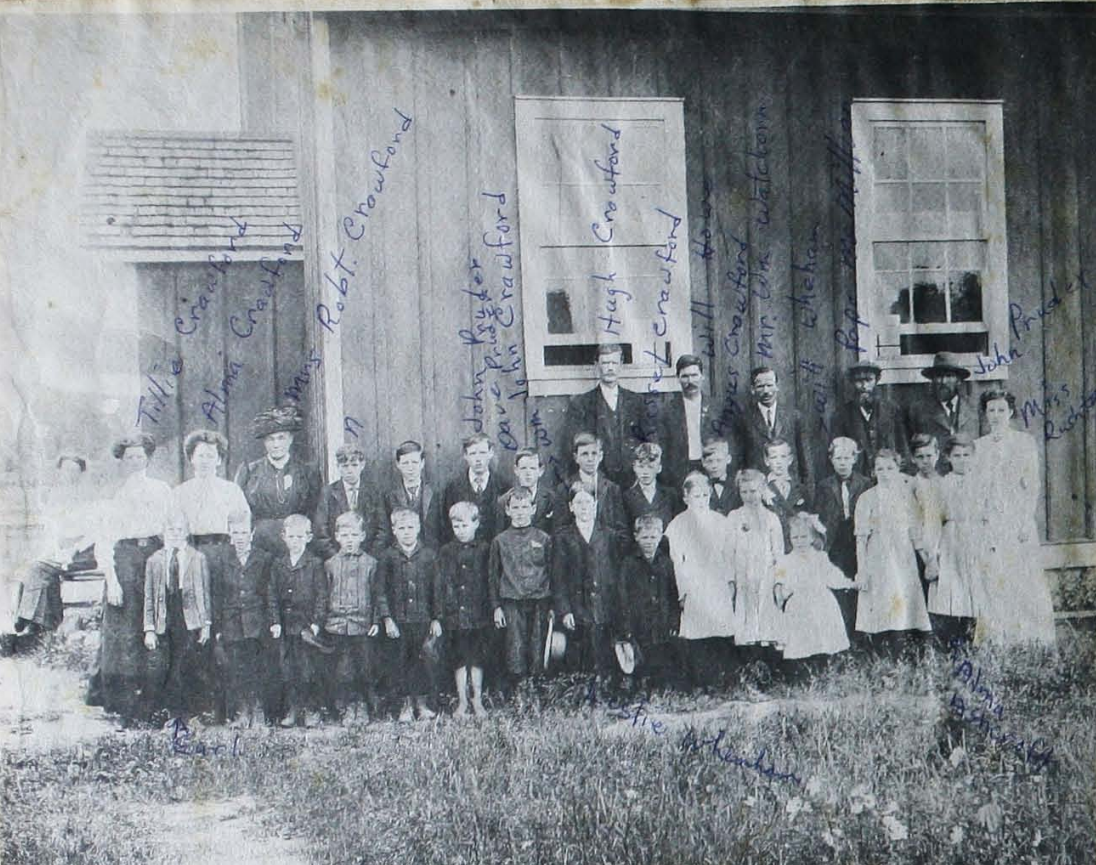
Purple Valley School a long time ago, no date