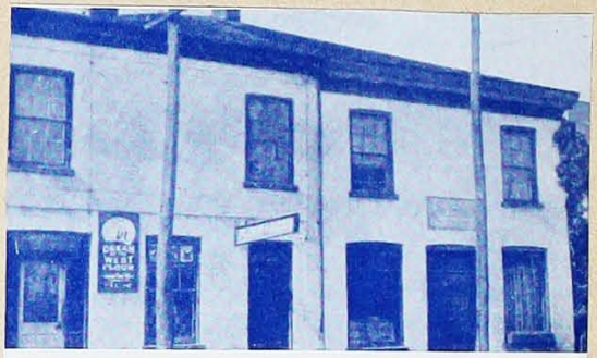
SQUIRES HALL, STONEY CREEK Where the First Women's Institute was Organized