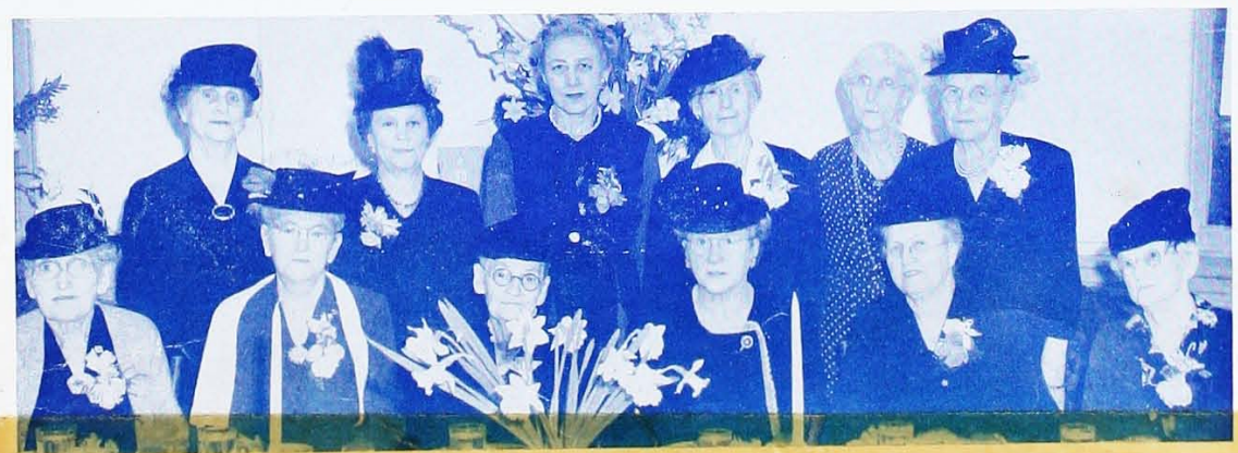
CHARTER MEMBERS OF THE FIRST INSTITUTE