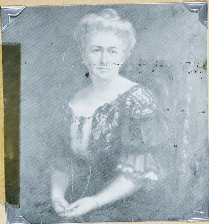
MRS. ADELAIDE HOODLESS Founder of the Women's Institutes