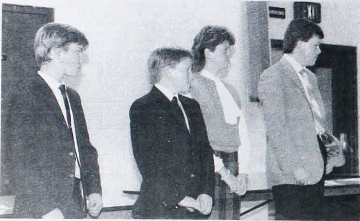
The 4-H Grain Club