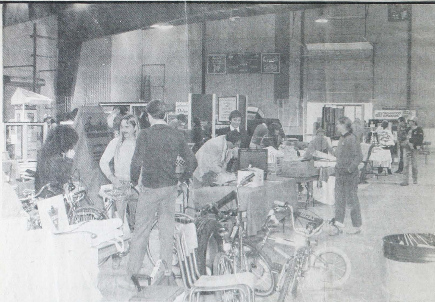
Scenes from Rotary Home Show at Community Centre