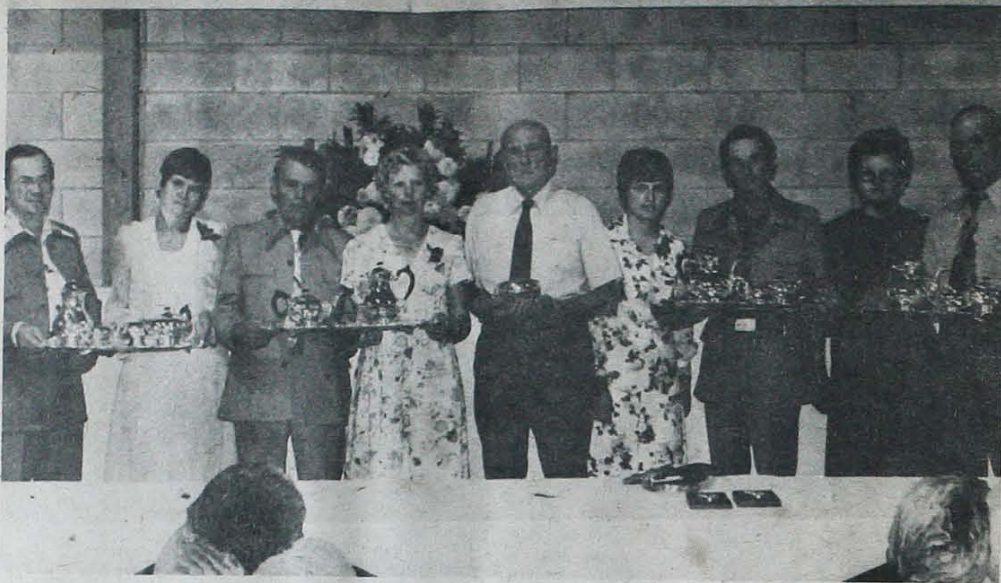
The top five contestants in the Farmstead Improvement 76 competition are pictured with their prizes following the announcement of the winners last Wednesday at the Ripley Complex. Winners in the five classes, from left to right are: