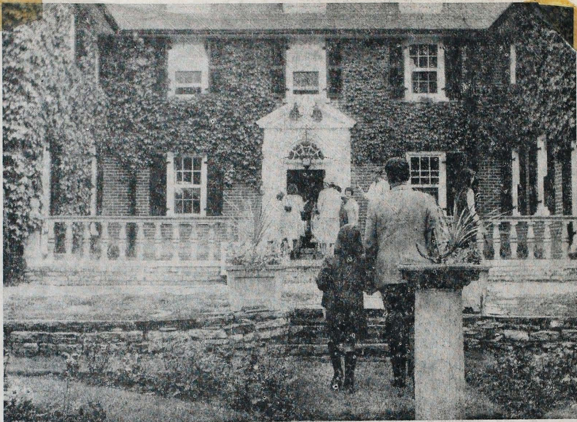
HUNDREDS VISIT BATTERWOOD — Batterwood, the Canton home of the late Rt. Hon. Vincent Massey, C.H., former Governor-General of Canada, was one of the main attractions on the Port Hope Architectural Conservancy

house tour, Saturday. Steady streams of sightseers poured into the main hall of the house throughout the day. The upper windows to the right is the room in which Her Majesty the Queen slept during her visit to Batterwood.