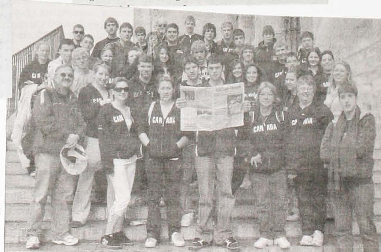
Thirty-three students from Walkerton District, and three students from John Dieffenbaker Secondary School went on a two-week trip to France and Spain, March 6-21, and remembered to take the Herald-Times along for some light reading, while visiting the Palais des Papes (Palace of the Popes) in Avignon, France.