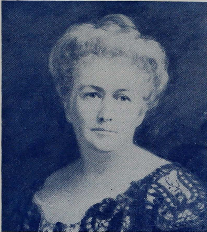
MRS. ADELAIDE HOODLESS Founder of the Women's Institutes