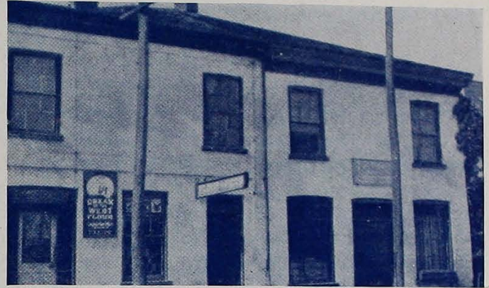
SQUIRES HALL, STONEY CREEK Where the First Women's Institute was Organized