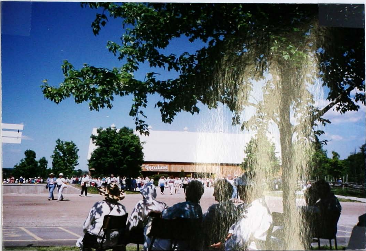
Gimbrell Barn where quilts were on display at the Agricultural Museum, Milton.